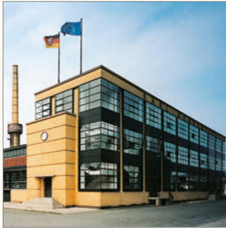
OUR HEADQUARTERS AT ALFELD - BUILT BY WALTER GROPIUS IN 1911